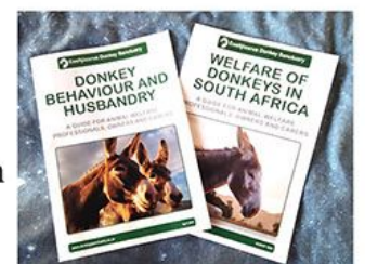
Each student receives these two manuals compiled by Eseltjiesrus.